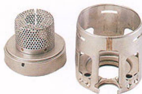
Stainless Steel Adapter Diffuser with Strainer