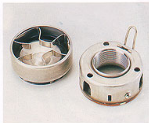
Stainless Steel Discharge Check Valve

The stainless steel strainer can prevent the entry of sand or other extraneous material.