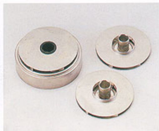
Stainless Steel Impeller Diffuser