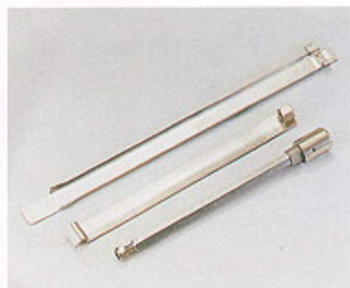
Stainless Steel Pump Shaft Strap and Cable Guard